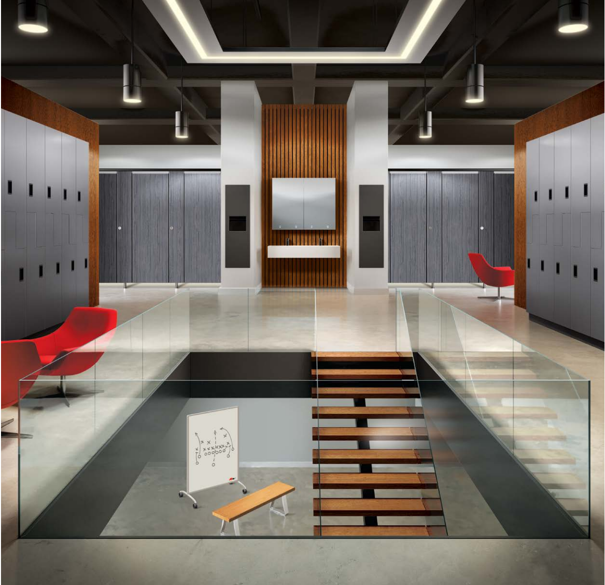
* Featured in this ad are our exclusive Velare™ and Piatto™ collection of washroom accessories, ASI Alpaco™ partitions, and ASI lockers.

A well designed bathroom and locker room can be the deciding factor in elevating a building from good to great, and we can provide you all the options to make that possible. ASI Group has changed the paradigm—we are the new standard for basis of design.